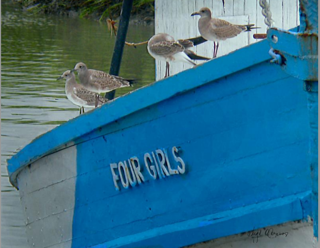
"Four Girls" by Hugh O'Connor