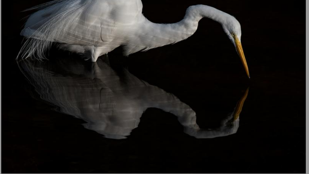
"The Fairest of Them All" by Edith Wood