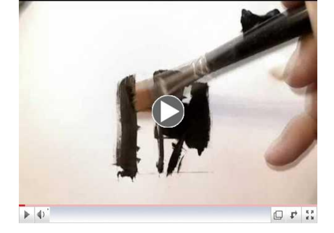
Notan - The Development and Basis of Strong Structure in Your Painting